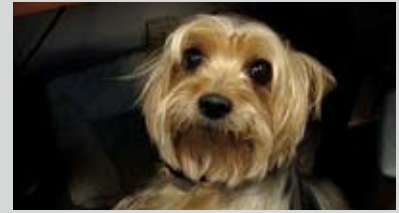
Huey, a silky terrier.