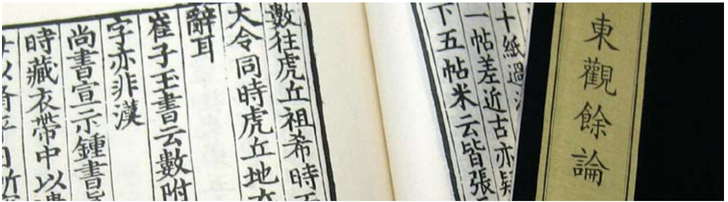
Reproductions of Chinese Rare Editions Series ( Zhonghua zaizao shanben ).

Stanford's East Asia Library ranked number one in the nation this year in support from library administration, surpassing traditionally well-funded peer institutions such as Harvard-Yenching and U.C. Berkeley. Despite financial challenges, special funding support from the University Librarian enabled EAL to purchase special collections and databases, and to meet users' research needs. Comparison statistics which include endowments and grants show Stanford's EAL in the top ten North American universities in every category.