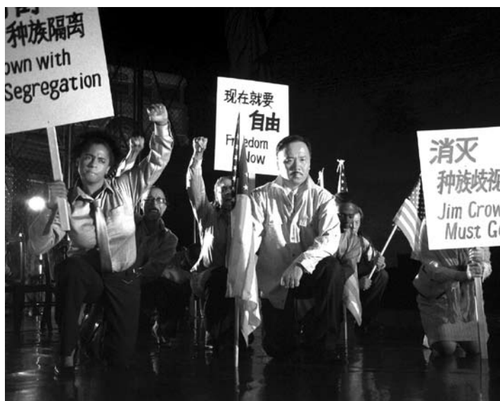
Beijing performance of Passages of Martin Luther King .